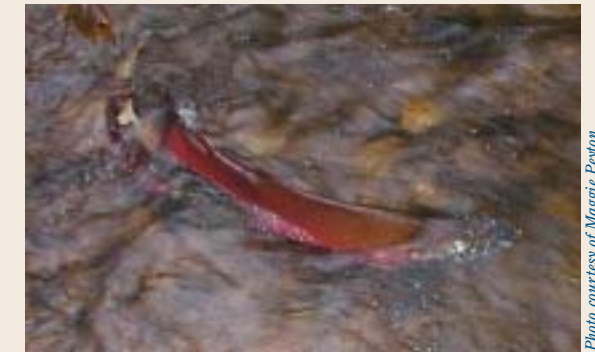
A spawning coho