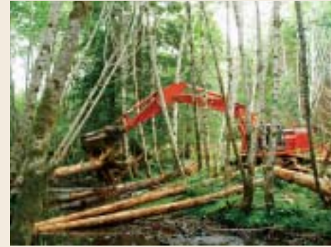
Landowner placing large wood in creek

The Oregon Plan encourages neighbors to work together. Why? Because, to be truly effective, habitat improvements have to happen all along a stream, across the various ownerships.