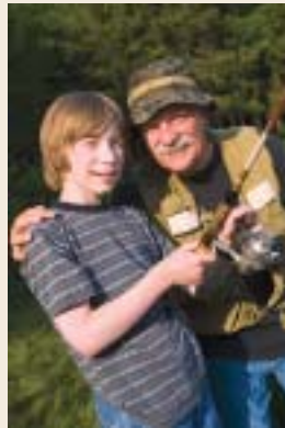
Fishing with grandpa

Maybe some day, wild "silvers" will become abundant again. It can happen—with everyone working together.