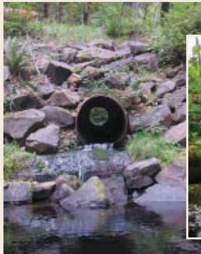
East Humbug Creek, with culvert, before bridge

Government regulators, watershed councils, non-profit groups and public land managers have a role in restoring coho habitat, but they can't do the whole job. If coho are ever to return to their former abundance, private landowners will need to join together to make a critical difference.