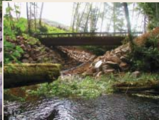
East Humbug Creek, after bridge