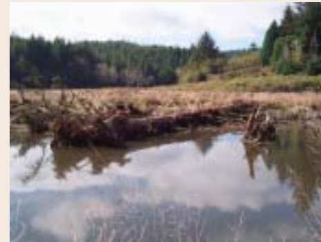
Large wood placed at the mouth of Dalton Creek, South Slough