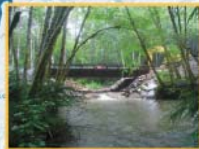
East Humbug Creek